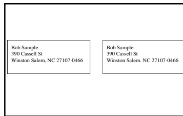
Envelope sample of address location